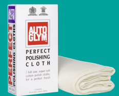
Perfect Polishing Cloth